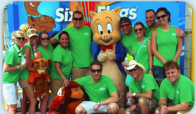
A VAMC outing to Six Flags with the Dallas, TX branch.