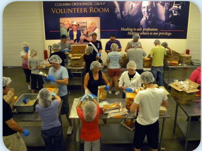
VAMC employees volunteer at the local Food Bank.