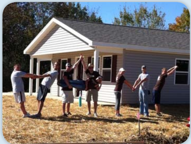
Habitat For Humanity – VAMC employees funded and built a house for a local veteran in 2010.